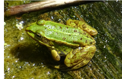
A frog in a pond.